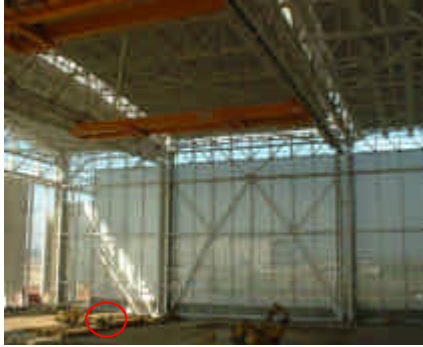
Internal view during construction. Personage at the ground level gives scale size