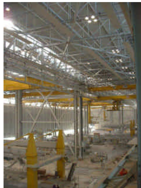
Indoor picture of the plane montage building

This huge structure can only be erected in an economical way using steel as material, fabricated sections and a trussed upper beam.