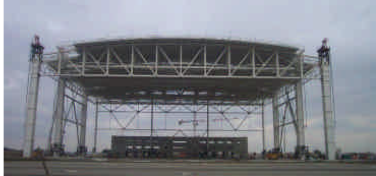
External view during erection of hall S34: 100 x 100 m². Building on the back gives scale size.